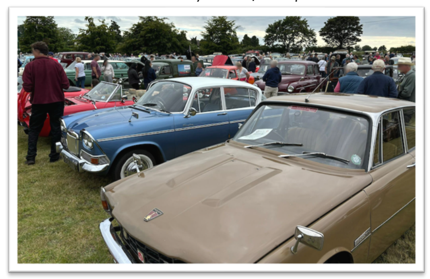
Many congratulations to the Friston Team once again for another successful fund raising event.